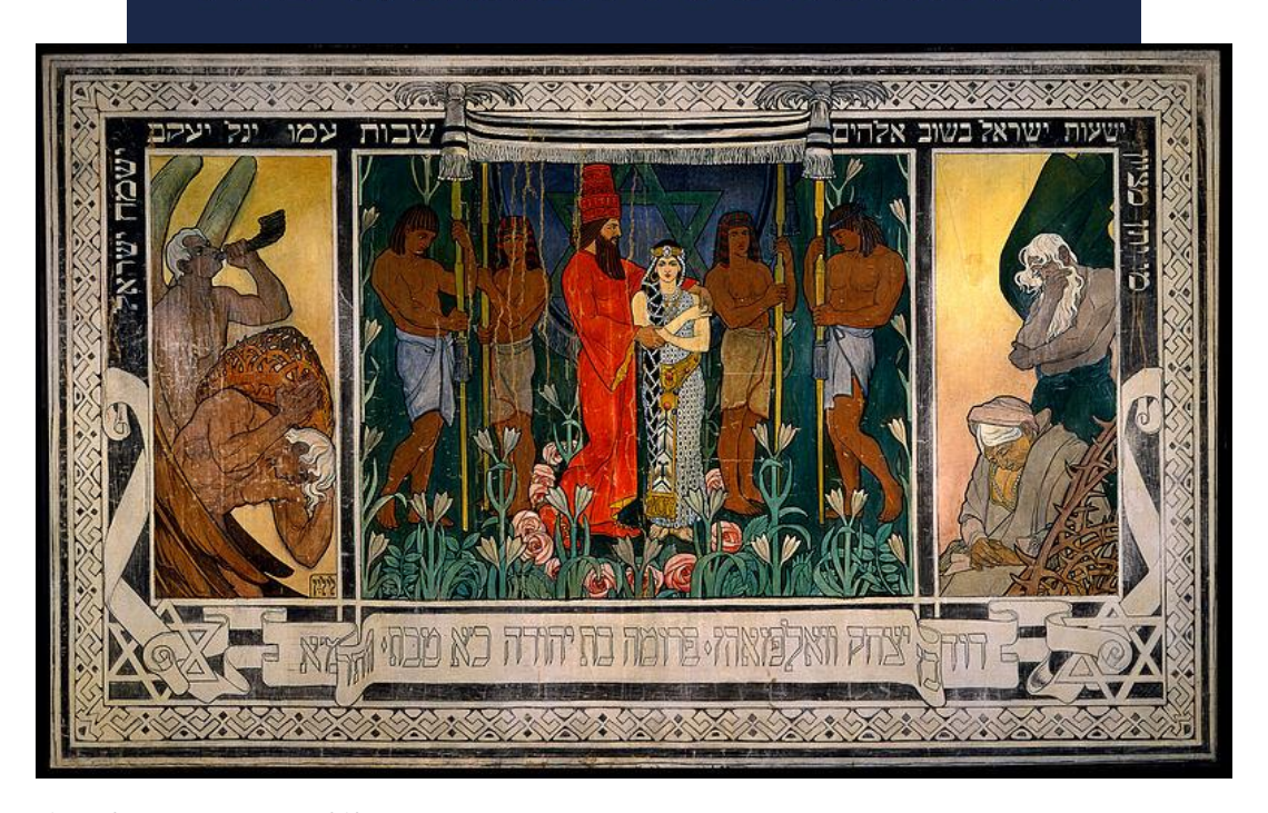
Ephraim Moses Lilien, An Allegorical Wedding, 1906