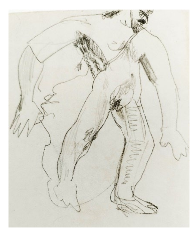
Early sketch of Nimrod, Pencil on paper, 25 x 19 cm, 1930s