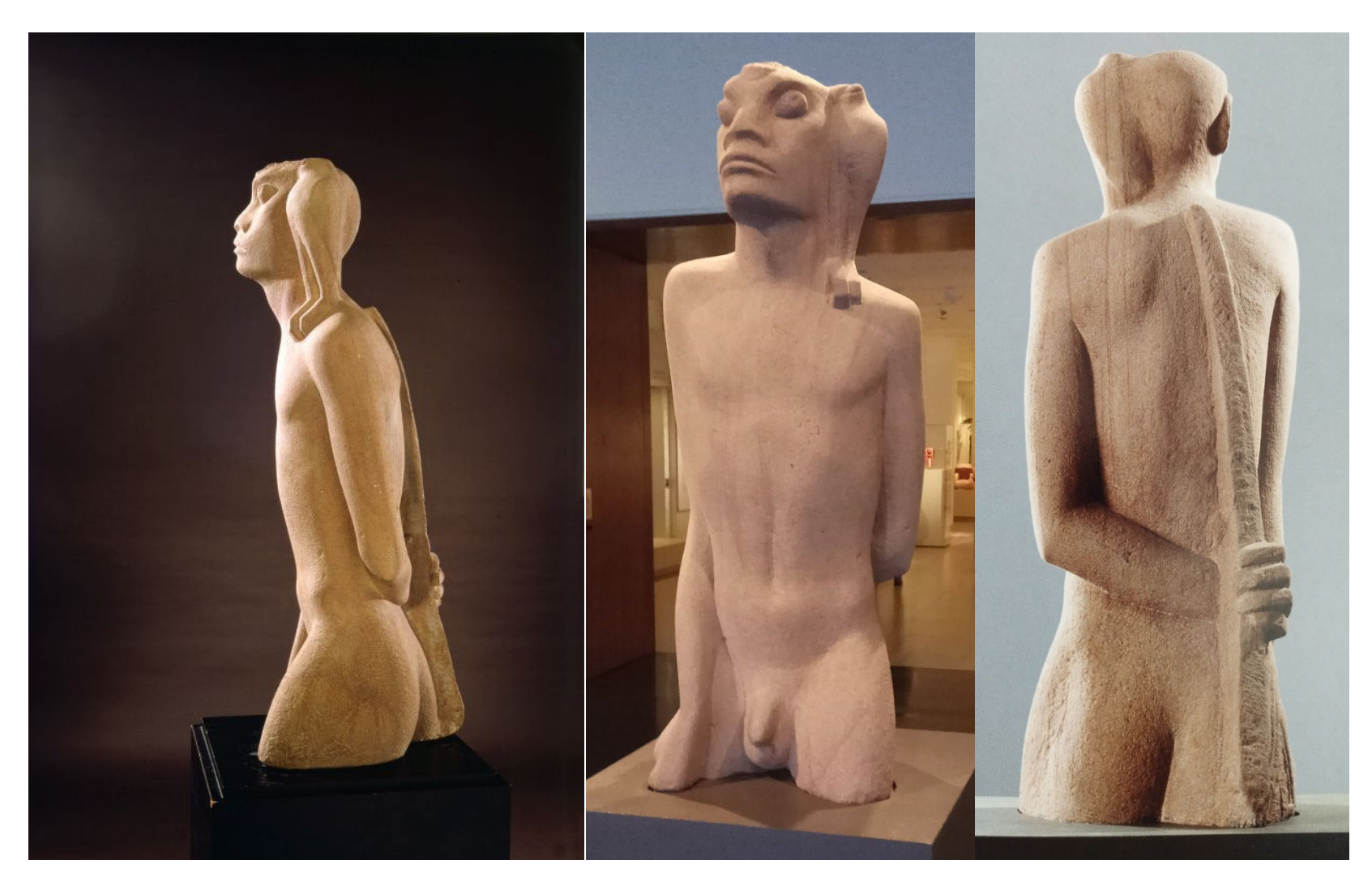
Nimrod, Yitzhak Danziger, 1939 Nubian sandstone, 95 x 33 x 33 cm